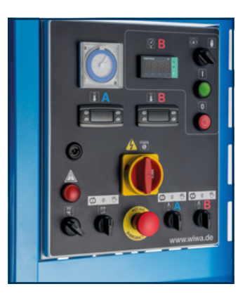
Large, clearly arranged control panel