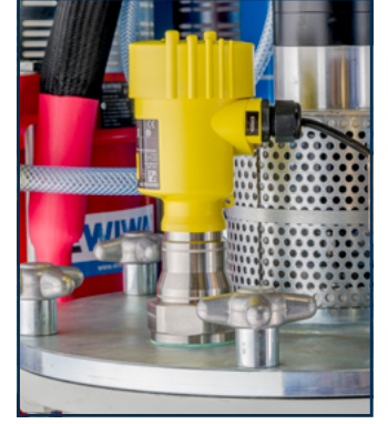
Radar sensors for level control