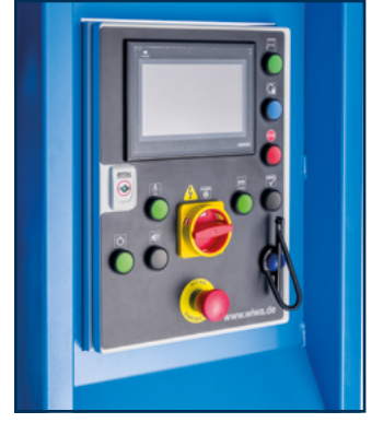
Large, clearly arranged display