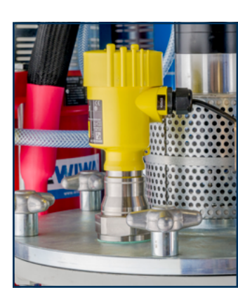
Radar sensors for level control