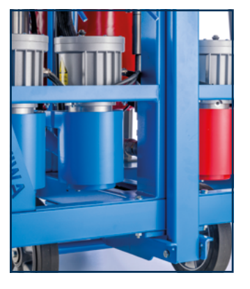
Electronically controllable material flow heaters