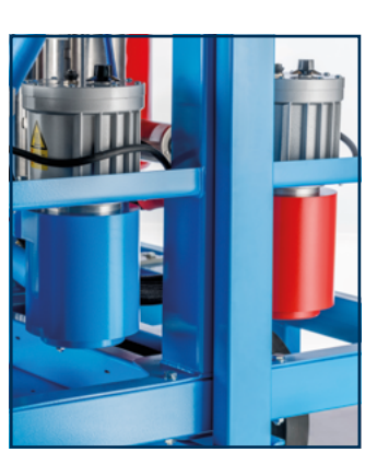
Adjustable material flow heaters