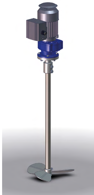
Agitator for 216.5l drum Order No. 0661873