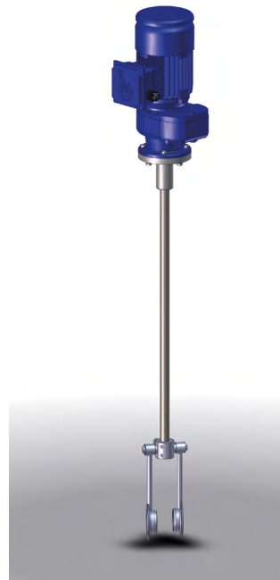
Agitator for 1000l IBC Order No. 0663027